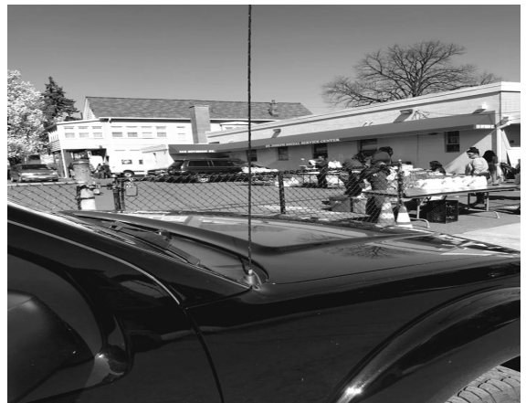
To St. Joseph's Social Service Center