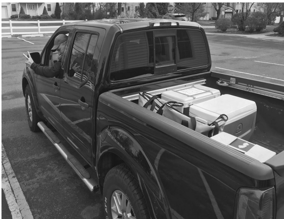
Brian's truck all loaded up to deliver food